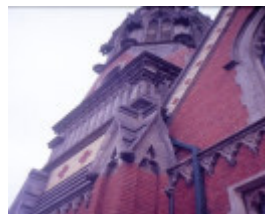
former congregational church and hall mair and dawson sts north ballarat close up steeple she project 2004