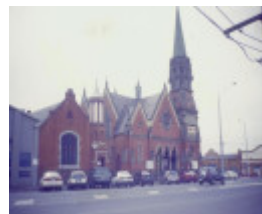
former congregational church and hall mair and dawson sts north ballarat exterior she project 2004