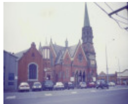
former congregational church and hall mair and dawson sts north ballarat exterior she project 2004