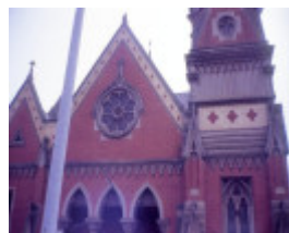
former congregational church and hall mair and dawson sts north ballarat windows she project 2004