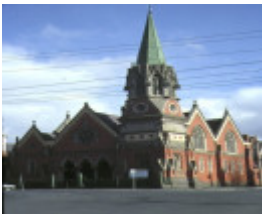
1 former congregational church ballarat front view aug1985