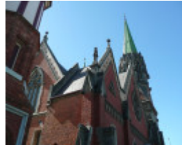
FORMER CONGREGATIONAL CHURCH AND HALL SOHE 2008