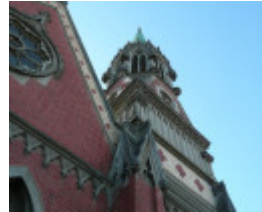
FORMER CONGREGATIONAL CHURCH AND HALL SOHE 2008