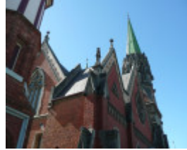
FORMER CONGREGATIONAL CHURCH AND HALL SOHE 2008