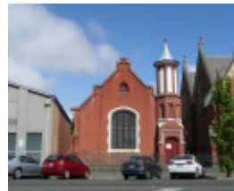
FORMER CONGREGATIONAL CHURCH AND HALL SOHE 2008