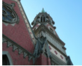
FORMER CONGREGATIONAL CHURCH AND HALL SOHE 2008