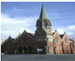
1 former congregational church ballarat front view aug1985