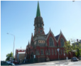
FORMER CONGREGATIONAL CHURCH AND HALL SOHE 2008