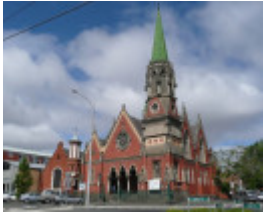
FORMER CONGREGATIONAL CHURCH AND HALL SOHE 2008