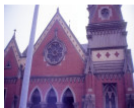
former congregational church and hall mair and dawson sts north ballarat windows she project 2004