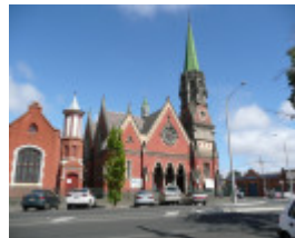
FORMER CONGREGATIONAL CHURCH AND HALL SOHE 2008