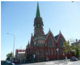
FORMER CONGREGATIONAL CHURCH AND HALL SOHE 2008