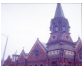
former congregational church and hall mair and dawson sts north ballarat steeple she project 2004