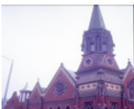
former congregational church and hall mair and dawson sts north ballarat steeple she project 2004