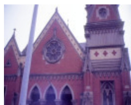
former congregational church and hall mair and dawson sts north ballarat windows she project 2004