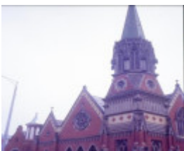
former congregational church and hall mair and dawson sts north ballarat steeple she project 2004