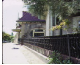
coolock house bendigo detail of front entrance & iron fence oct1988