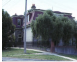
1 coolock house bendigo front view from street oct1988