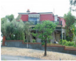
COOLOCK HOUSE SOHE 2008