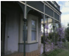
coolock house bendigo detail of verandah oct1980