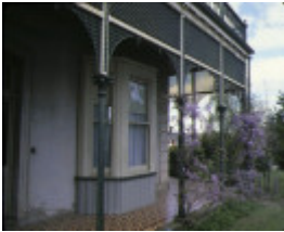
coolock house bendigo detail of verandah oct1980