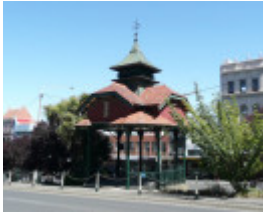
TITANIC MEMORIAL BANDSTAND SOHE 2008