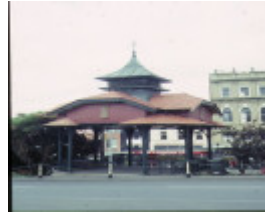
1 titanic memorial bandstand ballarat front view 1993