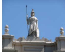
MECHANICS INSTITUTE SOHE 2008