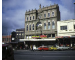
1 mechanics institute ballarat front street view aug1985