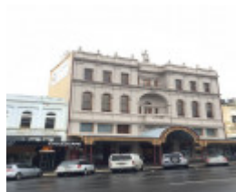
After Photographs - Reference F3924 2016