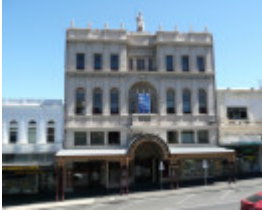
MECHANICS INSTITUTE SOHE 2008