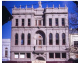
h00987 mechanics institute sturt st ballarat front view she project 2003