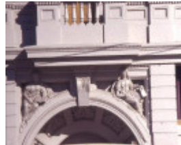
h00987 mechanics institute sturt st ballarat figures above vaulted entrance she project 2003