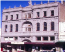
h00987 mechanics institute sturt st ballarat facade she project 2003