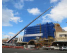
During Photographs - Reference F3924 2015