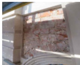
During Photographs - Reference F3924 2015