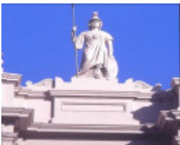
h00987 mechanics institute sturt st ballarat statue of minevra she project 2003