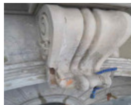
Before Photograph - Reference F3924 2014