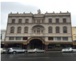
After Photographs - Reference F3924 2016