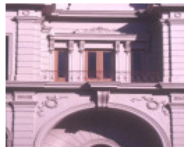
h00987 mechanics institute sturt st ballarat top floor balcony area she project 2003