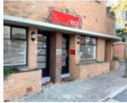
Flats & shops, 921 High Street