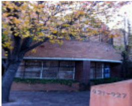
Flats & shops, 921 High Street