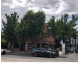
921-923 High Street, Armadale (2).jpeg