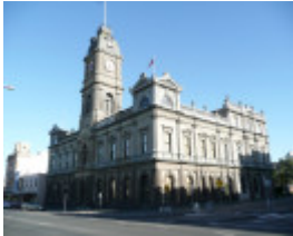
BALLARAT TOWN HALL SOHE 2008