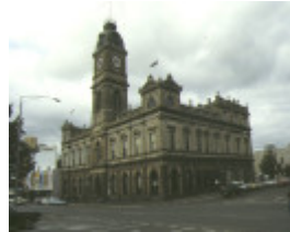
1 ballarat town hall exterior view 1993