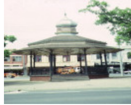
1 queen alexandra bandstand ballarat front detail