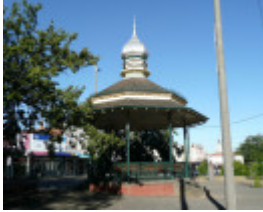
QUEEN ALEXANDRA BANDSTAND SOHE 2008