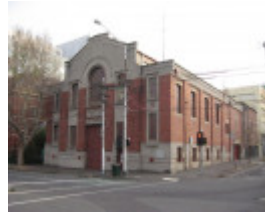
front and east side