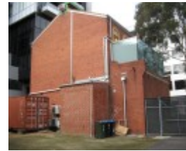
South Yarra tram substation rear view