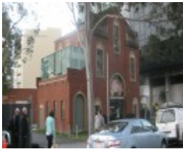
Tram substation Sth Yarra 5 Sep 2012 KJ (1).JPG