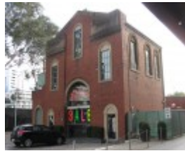
South Yarra tram substation