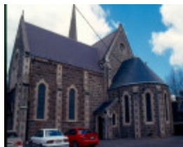
h00044 st andrews kirk ballarat north elevation oct03