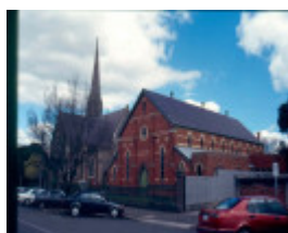
h00044 st andrews ballarat sunday school oct03