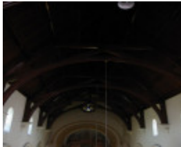
St Andrews Kirk Interior 02 Oct 03