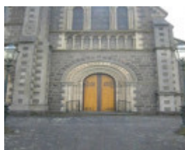
St Andrews Kirk Ballarat Door Oct 03