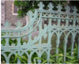
St Andrews Kirk Ballarat Fence 02 Oct 03