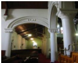
St Andrews Kirk Interior 03 Oct 03