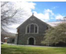
St Andrews Kirk West Transept 02 Oct 03