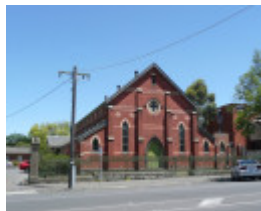
ST ANDREWS UNITING CHURCH SOHE 2008