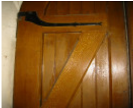
St Andrews Kirk Door Detail 01 Oct 03