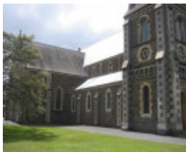
St Andrews Kirk West Elevation Oct 03