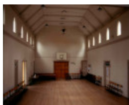
h00044 st andrews ballarat sunday school interior oct03