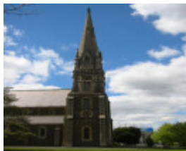
St Andrews Kirk Spire Oct 03