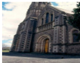
h00044 1 st andrews kirk ballarat front oct03