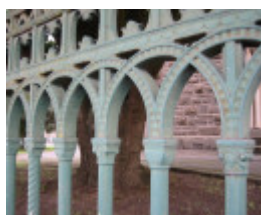
St Andrews Kirk Ballarat Fence Oct 03