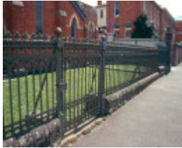
St Andrews Kirk Ballarat Fence 04 Oct 03