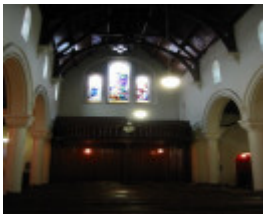
St Andrews Kirk Interior 03 Oct 03