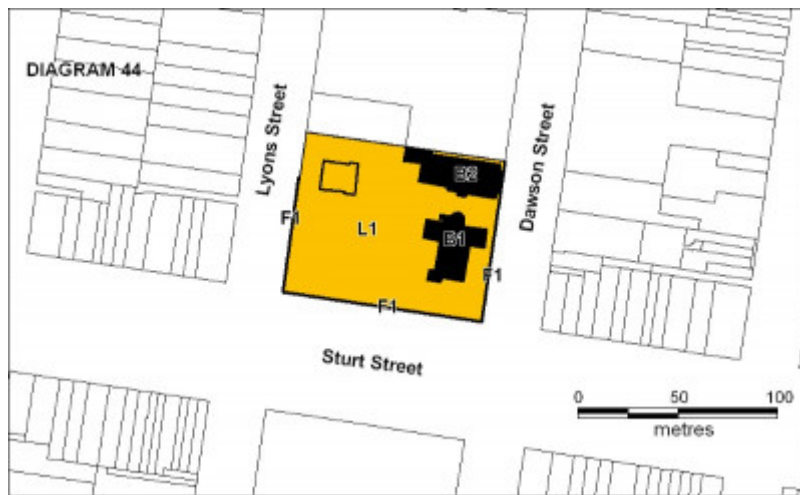
h00044 st andrews kirk plan sept2004