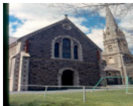
h00044 st andrews kirk ballarat west transept oct03