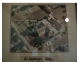
St Andrews Kirk Ballarat Aerial Oct 03