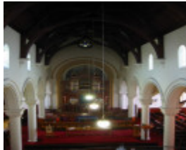
St Andrews Kirk Interior 01 Oct 03