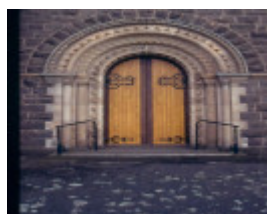
St Andrews Kirk Ballarat Door Detail Oct 03