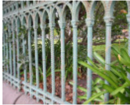
St Andrews Kirk Ballarat Fence 03 Oct 03