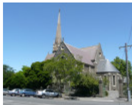
ST ANDREWS UNITING CHURCH SOHE 2008