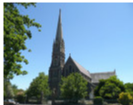
ST ANDREWS UNITING CHURCH SOHE 2008