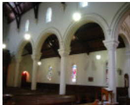
St Andrews Kirk Interior 04 Oct 03