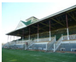
CAMPERDOWN TURF CLUB GRANDSTAND SOHE 2008