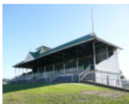
CAMPERDOWN TURF CLUB GRANDSTAND SOHE 2008