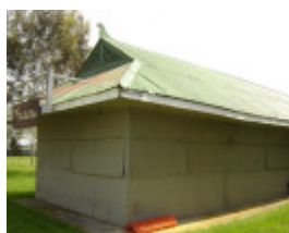
H2093 Camperdown racecourse grandstand bull bar1 oct05