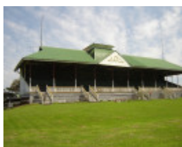
H2093 Camperdown racecourse grandstand front4 oct05