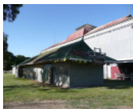
CAMPERDOWN TURF CLUB GRANDSTAND SOHE 2008