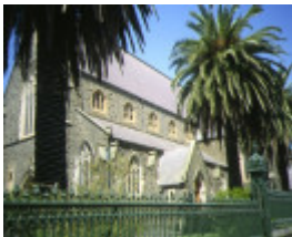
1 st patrick's cathedral ballarat exterior view of cathedral