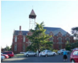
ST PATRICKS CATHEDRAL AND HALL SOHE 2008