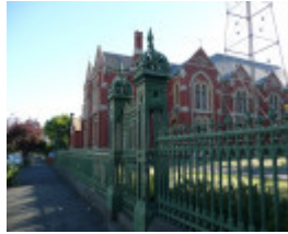
ST PATRICKS CATHEDRAL AND HALL SOHE 2008