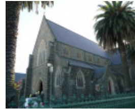
ST PATRICKS CATHEDRAL AND HALL SOHE 2008