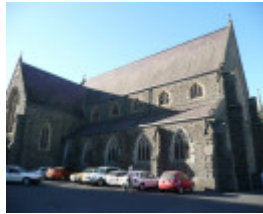
ST PATRICKS CATHEDRAL AND HALL SOHE 2008