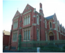
ST PATRICKS CATHEDRAL AND HALL SOHE 2008