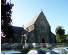
ST PATRICKS CATHEDRAL AND HALL SOHE 2008