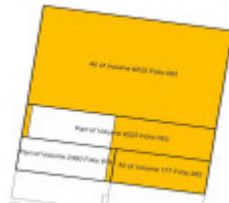
St Patricks Ballarat cadastral layout.JPG