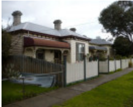
35-37 SOUDAN ST