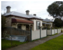
35-37 SOUDAN ST