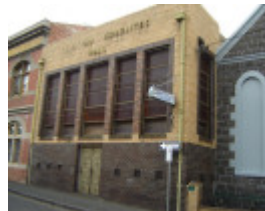
H0097 Christian Israelite Church Fitzroy 17Mar06 hall front1