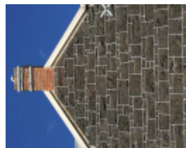
CHRISTIAN ISRAELITE SANCTUARY October 2016