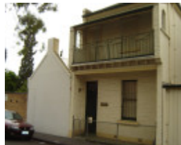
H0097 Christian Israelite Church Fitzroy 17Mar06 house caretaker exterior