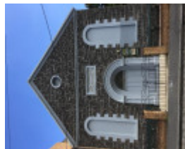
CHRISTIAN ISRAELITE SANCTUARY October 2016