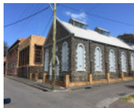
CHRISTIAN ISRAELITE SANCTUARY October 2016