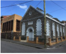
CHRISTIAN ISRAELITE SANCTUARY October 2016