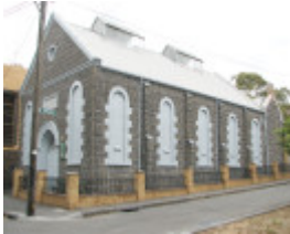
CHRISTIAN ISRAELITE SANCTUARY SOHE 2008