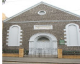
CHRISTIAN ISRAELITE SANCTUARY SOHE 2008