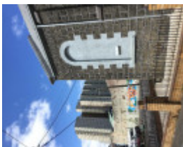
CHRISTIAN ISRAELITE SANCTUARY October 2016