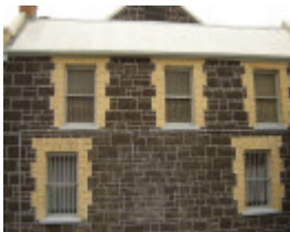
H0097 Christian Israelite Church Fitzroy 17Mar06 rear2