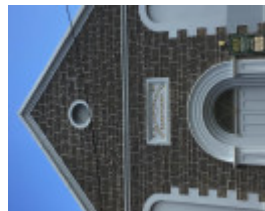
CHRISTIAN ISRAELITE SANCTUARY October 2016