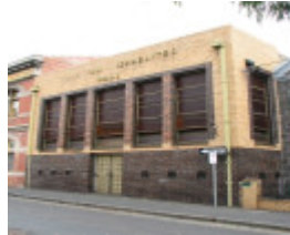
CHRISTIAN ISRAELITE SANCTUARY SOHE 2008