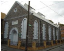
H0097 Christian Israelite Church Fitzroy 17Mar06 front2