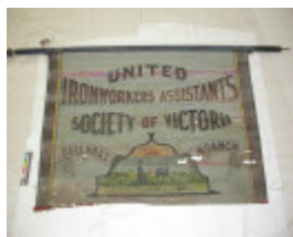
h02086 eight hour day banner uias