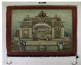
h02086 trade union banner1