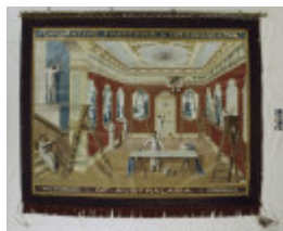
h02086 eight hour day banner painters1