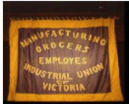
h02086 eight hour day banner mgeiu