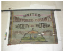
h02086 eight hour day banner uias