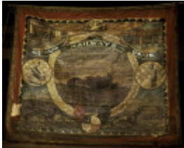
h02086 1 trade union banner2