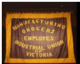
h02086 eight hour day banner mgeiu