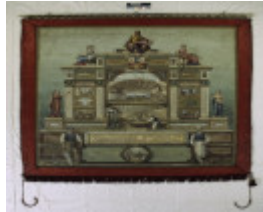
h02086 trade union banner1