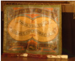
h02086 eight hour day banner boot trade1