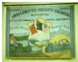
h02086 eight hour day banner ase