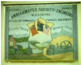
h02086 eight hour day banner ase