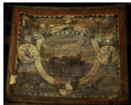
h02086 1 trade union banner2