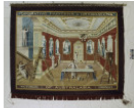
h02086 eight hour day banner painters1