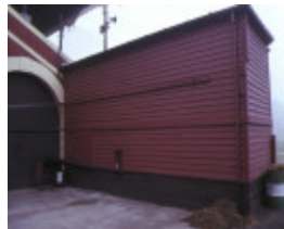
queen elizabeth oval grandstand bendigo entrance