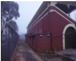
queen elizabeth oval grandstand bendigo rear view