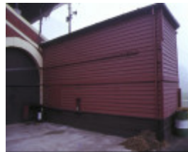
queen elizabeth oval grandstand bendigo entrance