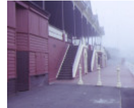
queen elizabeth oval grandstand bendigo front stairs