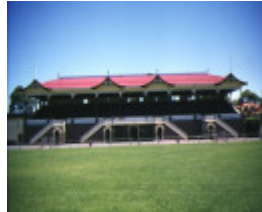
1 queen elizabeth grandstand bendigo front view