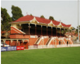
QUEEN ELIZABETH OVAL GRANDSTAND SOHE 2008