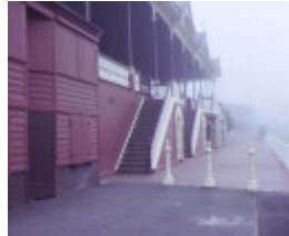
queen elizabeth oval grandstand bendigo front stairs