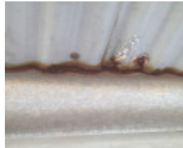
Before Photographs - Reference F3880 2014