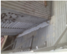
Before Photographs - Reference F3880 2014