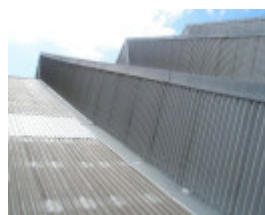
After Photograph - Reference F3880 2016