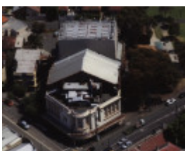
After Photograph - Reference F3880 2016