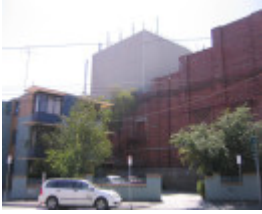
Before Photographs - Reference F3923 2014