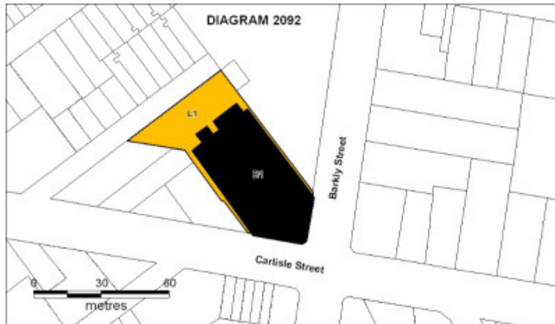
H2092 National theatre st kilda plan