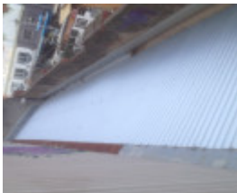
After Photographs - Reference F3880 2016