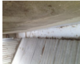
Before Photographs - Reference F3880 2014