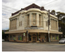
H2092 National theatre st kilda ac nov05 front