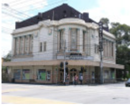
NATIONAL THEATRE SOHE 2008