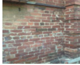
Before Photographs - Reference F3923 2014