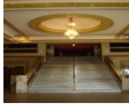
H2092 National theatre st kilda ac nov05 foyer stairs3