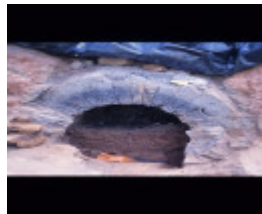
Chinese Kiln Bendigo.jpg