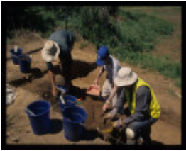
H2106 Chinese Kiln nov 2005 photo 5.jpg