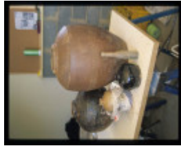
H2106 Chinese Kiln nov 2005 photo 6.jpg