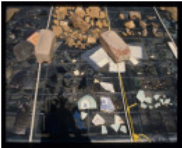
H2106 Chinese Kiln nov 2005 photo 14.jpg