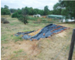
CHINESE KILN & MARKET GARDEN SOHE 2008