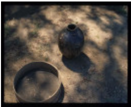
H2106 Chinese Kiln nov 2005 photo 17.jpg