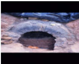
CHINESE KILN & MARKET GARDEN