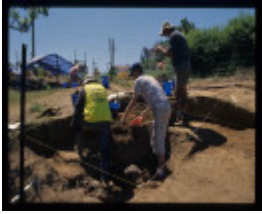
H2106 Chinese Kiln nov 2005 photo 8.jpg