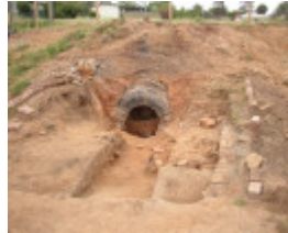
H2106 Chinese Kiln and Market Garden Bendigo Nth excavation