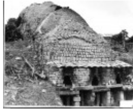
hill kiln china.jpg