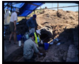
H2106 Chinese Kiln nov 2005 photo 1.jpg