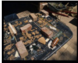
H2106 Chinese Kiln nov 2005 photo 15.jpg