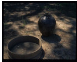
H2106 Chinese Kiln nov 2005 photo 18.jpg