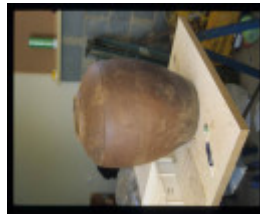
H2106 Chinese Kiln nov 2005 photo 19.jpg