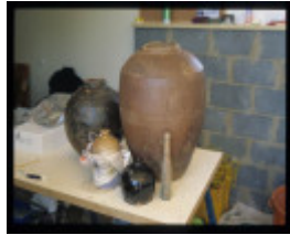
H2106 Chinese Kiln nov 2005 photo 21.jpg