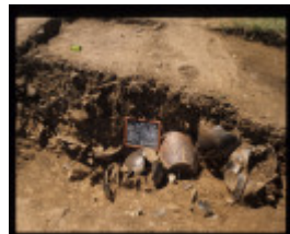
CHINESE KILN & MARKET GARDEN