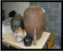
H2106 Chinese Kiln nov 2005 photo 20.jpg