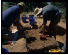
H2106 Chinese Kiln nov 2005 photo 11.jpg