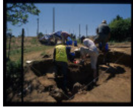
H2106 Chinese Kiln nov 2005 photo 9.jpg