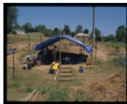
H2106 Chinese Kiln nov 2005 photo 4.jpg