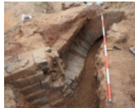
H2106 Chinese Kiln and Market Garden. Connection of kiln bowl to uphill fire box exposed during Investigations 22 May 2012