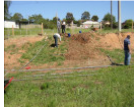
H2106 Chinese Kiln and Market Garden Bendigo Nth