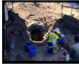
H2106 Chinese Kiln nov 2005 photo 7.jpg