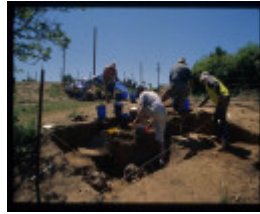
H2106 Chinese Kiln nov 2005 photo 13.jpg