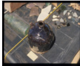
H2106 Chinese Kiln nov 2005 photo 16.jpg