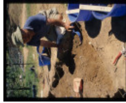
H2106 Chinese Kiln nov 2005 photo 10.jpg