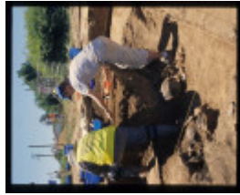
H2106 Chinese Kiln nov 2005 photo 12.jpg