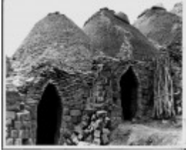
lungtan pottery hainan.jpg