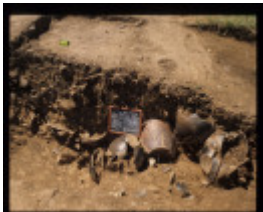
Chinese Kiln Bendigo2.jpg