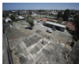
aerial image of site visit 22/1/14