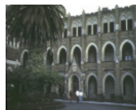
1 loreto convent ballarat abbey side view