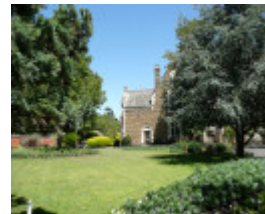
FORMER MARYS MOUNT CONVENT SOHE 2008