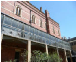
FORMER MARYS MOUNT CONVENT SOHE 2008