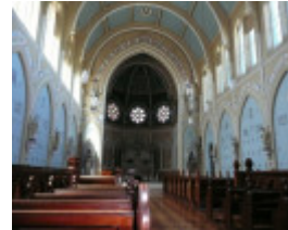
FORMER MARYS MOUNT CONVENT SOHE 2008