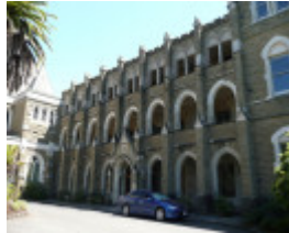
FORMER MARYS MOUNT CONVENT SOHE 2008