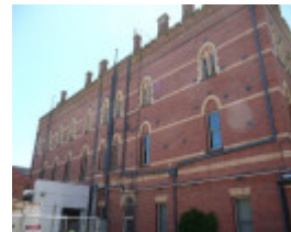
FORMER MARYS MOUNT CONVENT SOHE 2008