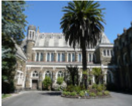
FORMER MARYS MOUNT CONVENT SOHE 2008