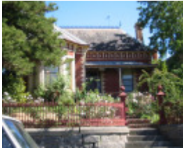
16 Seymour Crescent