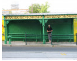
TRAM VERANDAH SHELTER SOHE 2008