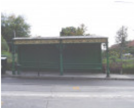
H0173 Tram shelter Kew front