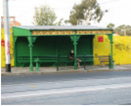
TRAM VERANDAH SHELTER SOHE 2008