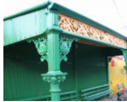
TRAM VERANDAH SHELTER SOHE 2008