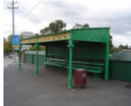
H0175 Tram shelter Toorak Station Armadale 03