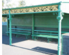
TRAM VERANDAH SHELTER SOHE 2008