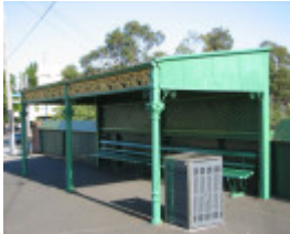
TRAM VERANDAH SHELTER SOHE 2008