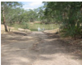
Barmah Punt_Barmah_Feb 2008_mz_Crossing