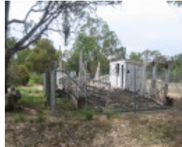
Barmah Punt_Barmah_Feb 2008_mz_North Elevation