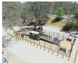
Barmah Punt LHGP Works Completed 2019