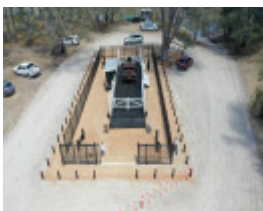
Barmah Punt LHGP Works Completed 2019 2