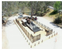
Barmah Punt LHGP Works Completed 2019 3