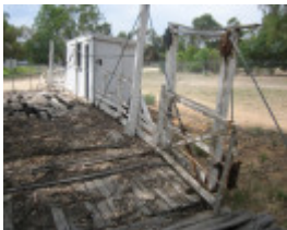
Barmah Punt_Barmah_Feb 2008_mz_Deck and Engine House