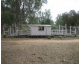
Barmah Punt_Barmah_Feb 2008_mz_Side View