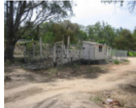
Barmah Punt_Barmah_Feb 2008_mz_Side View 02