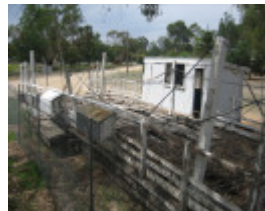
Barmah Punt_Barmah_Feb 2008_mz_Deck and Engine House 02