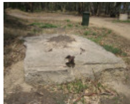
Barmah Punt_Barmah_Feb 2008_mz_Anchor Point