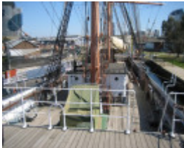
14368 Polly Woodside 4 Deck Oct 2006 mz