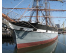
14368 Polly Woodside Bow 4 Oct 2006 mz