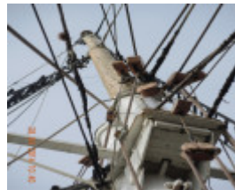
Before Photograph - Reference F3930 2014