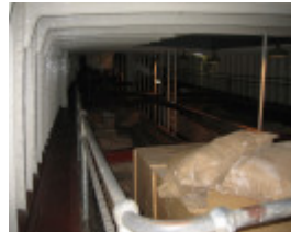
14368 Polly Woodside Hold 4 Oct 2006 mz