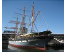
14368 Polly Woodside Stern 4 Oct 2006 mz