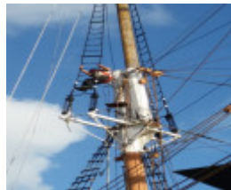
During Photograph - Reference F3930 2015