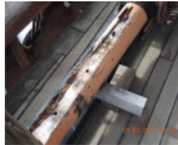
Before Photograph - Reference F3930 2014