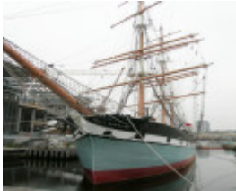
POLLY WOODSIDE SOHE 2008