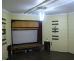
Warracknabeal Town Hall interior of auditorium 2009