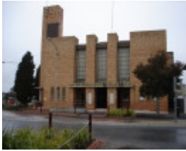
14390 Warracknabeal Town Hall