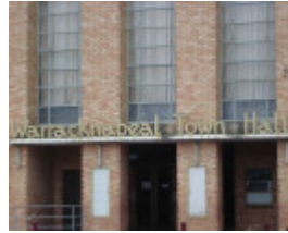
14390 Warracknabeal Town Hall