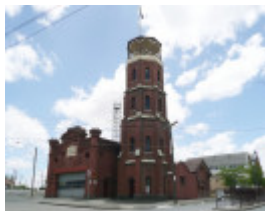
BALLARAT FIRE STATION SOHE 2008