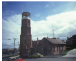
1 ballarat fire station front view aug1985