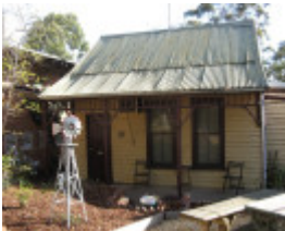
Diamond House_Stawell_timber cottage_Kj_29 may 08