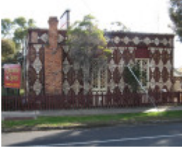
Diamond House_Stawell_ Kj_29/5/08