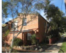
Diamond House_Stawell_rear wing_KJ_29 May 08