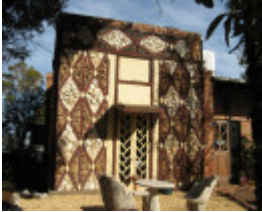
Diamond House_Stawell_garden elevation_KJ_29/5/08