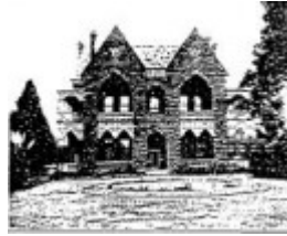
Bishops Palace - - Film 3 / Frame 11,16,17 - Ballarat Conservation Study, 1978