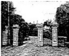
Bishops Palace - - Film 3 / Frame 11,16,17 - Ballarat Conservation Study, 1978