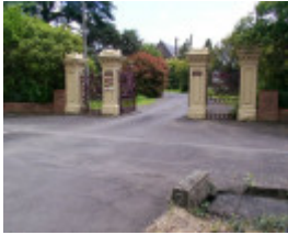
1444 Sturt Street