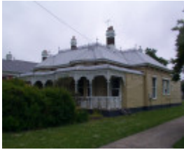
1421 Sturt Street