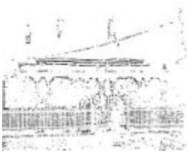
1421 Sturt Street - Film 7 / Frame 31 - Ballarat Conservation Study, 1978