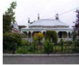
1421 Sturt Street