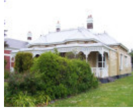
1421 Sturt Street