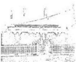
1421 Sturt Street - Film 7 / Frame 31 - Ballarat Conservation Study, 1978