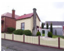
22 Barkly Street