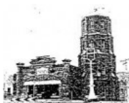
East Ballarat Fire Station - Ballarat Heritage Review, 1998