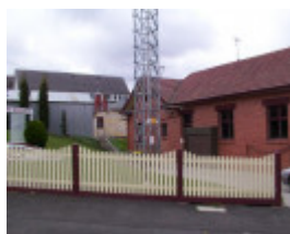
22 Barkly Street