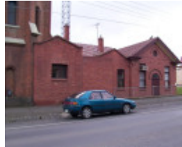
22 Barkly Street