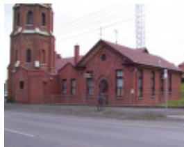
22 Barkly Street