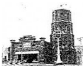
East Ballarat Fire Station - Ballarat Conservation Study, 1978