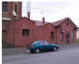
22 Barkly Street