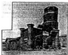
East Ballarat Fire Station - Ballarat Conservation Study, 1978