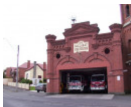
22 Barkly Street