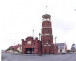
22 Barkly Street