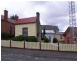
22 Barkly Street