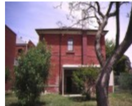
DUDLEY HOUSE SOHE 2008 1 dudley house bendigo front elevation 1998 dudley house bendigo rear view nov1998