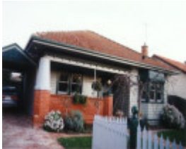
House at 10 Ellison St