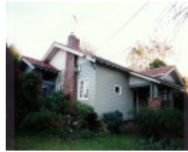
Mt Dandenong Rd 149