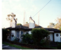
House at 153 Mt Dandenong Rd