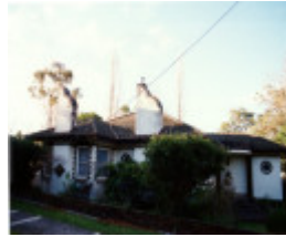
House at 153 Mt Dandenong Rd