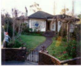
House at 153 Mt Dandenong Rd