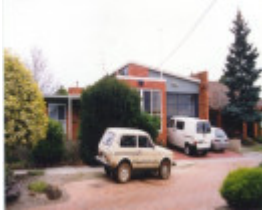
Pitt St 28-28A