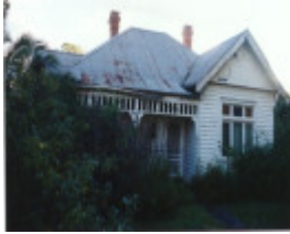
House at 49 Warrandyte Rd