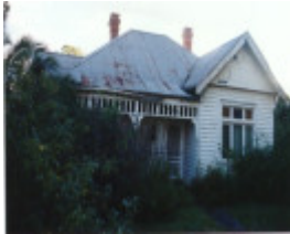
House at 49 Warrandyte Rd