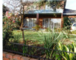
2 semi-detached houses