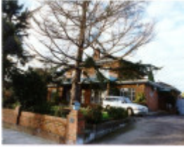
2 semi-detached houses