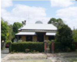
YARROWEE HALL SOHE 2008