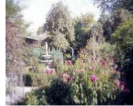
h01168 yarrowee hall darling street ballarat front garden she project 2003