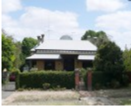
YARROWEE HALL SOHE 2008