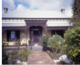
h01168 1 yarrowee hall darling street ballarat facade of house she project 2003