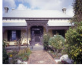
h01168 1 yarrowee hall darling street ballarat facade of house she project 2003