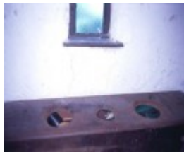
h01168 yarrowee hall darling street ballarat three seater outhouse she project 2003