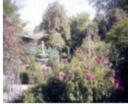
h01168 yarrowee hall darling street ballarat front garden she project 2003