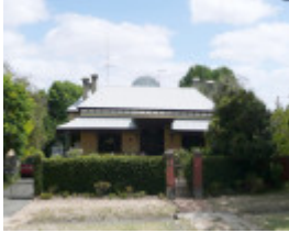
YARROWEE HALL SOHE 2008