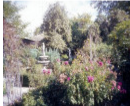
h01168 yarrowee hall darling street ballarat front garden she project 2003