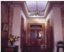
h01168 yarrowee hall darling street ballarat grand hall atrium above she project 2003