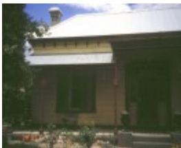
h01168 yarrowee hall darling street ballarat front elevation