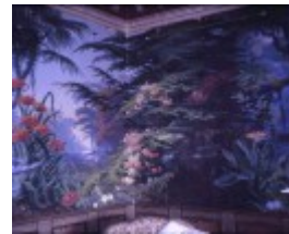
h01168 yarrowee hall darling street ballarat wallpaper detail she project 2003