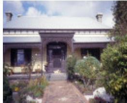
h01168 1 yarrowee hall darling street ballarat facade of house she project 2003