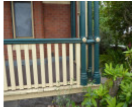
H1898 CLOWANCE LHA 2015 4.JPG