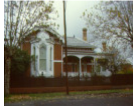
1 clowance ballarat ac2 june00