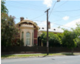
CLOWANCE SOHE 2008