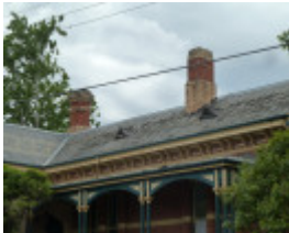
H1898 CLOWANCE LHA 2015 2.JPG