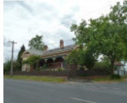
H1898 CLOWANCE LHA 2015 1.JPG