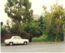
Hawthorn Heritage study 1992