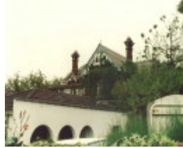
Hawthorn Heritage study 1992