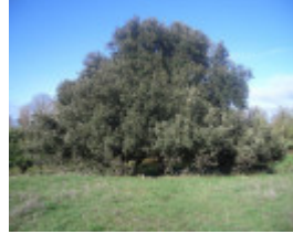
T12144 Quercus ilex