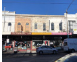
89 Chapel Street, Windsor