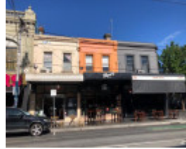
124-128 Chapel Street, Windsor