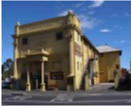
House at 405 Melbourne Road NEWPORT, Hobsons Bay Heritage Study 2006