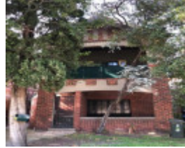
872 Malvern Road, Armadale