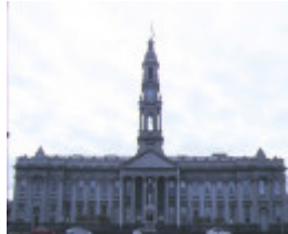
SOUTH MELBOURNE TOWN HALL SOHE 2008 1 town hall bank street south melb front view