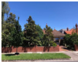
5 Kingston Street, Malvern East.