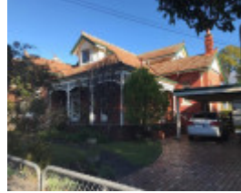
19 Turner Street, Malvern East