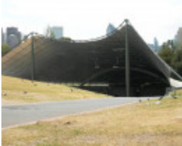
SIDNEY MYER MUSIC BOWL SOHE 2008