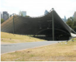
SIDNEY MYER MUSIC BOWL SOHE 2008